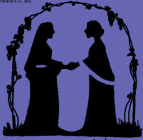
Visitation of the Blessed Virgin Mary