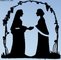
Visitation of the Blessed Virgin Mary