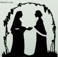
Visitation of the Blessed Virgin Mary