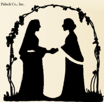
Visitation of the Blessed Virgin Mary