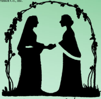
Visitation of the Blessed Virgin Mary