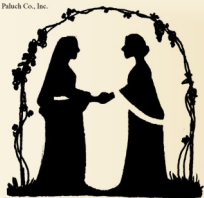
Visitation of the Blessed Virgin Mary