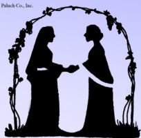
Visitation of the Blessed Virgin Mary