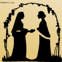
Visitation of the Blessed Virgin Mary