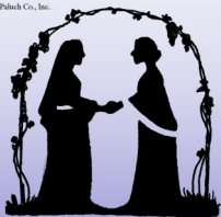
Visitation of the Blessed Virgin Mary