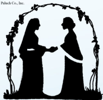
Visitation of the Blessed Virgin Mary