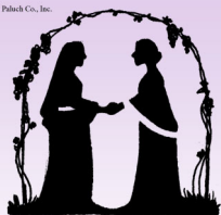
Visitation of the Blessed Virgin Mary