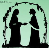
Visitation of the Blessed Virgin Mary