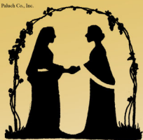
Visitation of the Blessed Virgin Mary