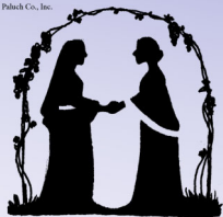
Visitation of the Blessed Virgin Mary