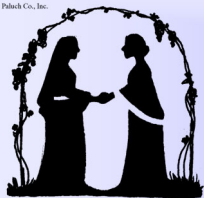
Visitation of the Blessed Virgin Mary