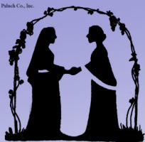
Visitation of the Blessed Virgin Mary