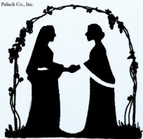
Visitation of the Blessed Virgin Mary