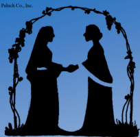
Visitation of the Blessed Virgin Mary